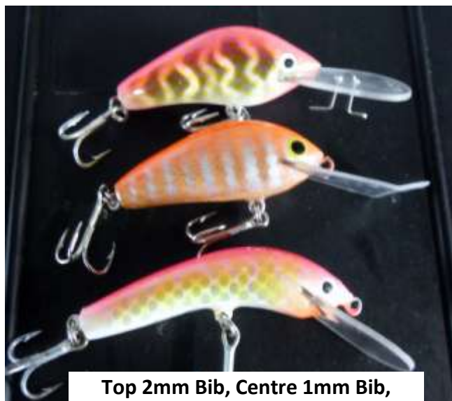
Top 2mm Bib, Centre 1mm Bib, Bottom 2mm