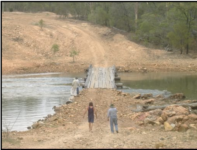
Bridge over (nameless?) tidal creek on the way to Pancake Creek

The road in was a very poor gravel pavement – really just an access track bulldozed through to allow the construction of a power (telephone?) line along it. It took 25 minutes of slow and careful driving to get to what we believe is a nameless tidal creek with a dilapidated timber bridge over it. At high tide on a big tide water crosses the road on the far (southern) side of the bridge (bottom of picture) – but the tide rises and falls so quickly you could easily wait for it to fall if you were unsure about driving through the water.