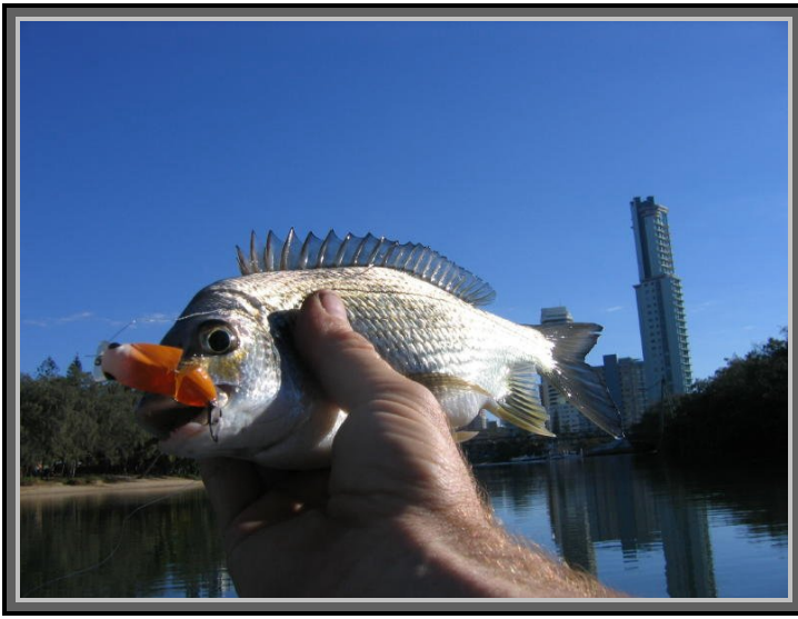
"Tis the season" winter Bream on the Goldie.

THE NEXT MEETING WILL BE ON MONDAY the 2 nd of July 2007 at 7:30pm (even if it's a public holiday) at the Beenleigh Bowls Club, 11 Hanover Street, Beenleigh. See access map further on in this Newsletter.