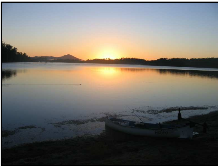
Sunrise at Maroon Dam. Early morning on our May club trip.

THE NEXT MEETING WILL BE ON MONDAY the 7 th of July 2008 at 7:30pm (even if it's a public holiday) at the Beenleigh Bowls Club, 11 Hanover Street, Beenleigh. See access map further on in this Newsletter.