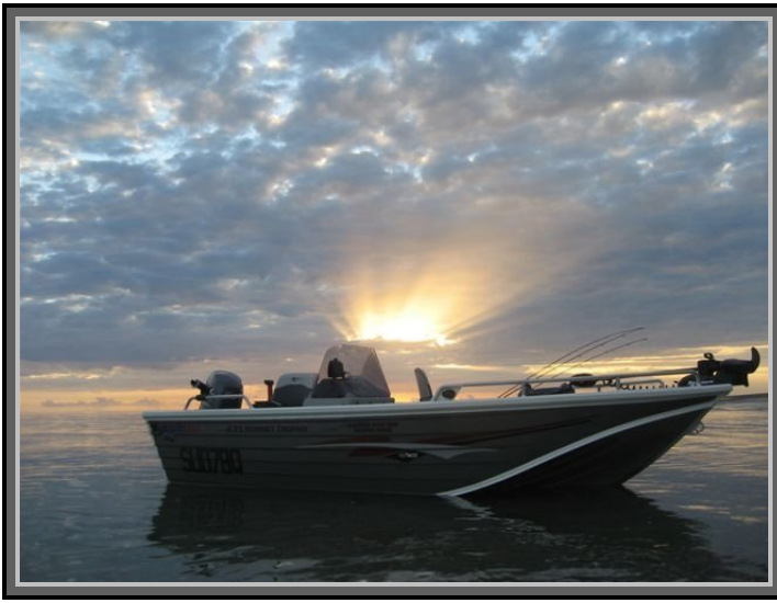
Burrum heads sunrise

THE NEXT MEETING WILL BE ON MONDAY the 4 TH of June 2007 at 7:30pm (even if it's a public holiday) at the Beenleigh Bowls Club, 11 Hanover Street, Beenleigh. See access map further on in this Newsletter.