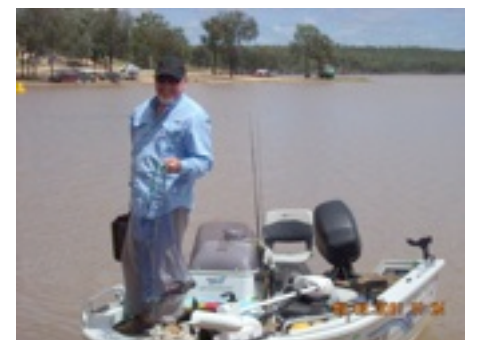
Behind me are great camp sites on the edge of the dam so you can leave your boat in the water.