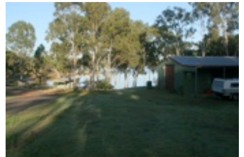
This is looking from JC and Mal,s camp overlooking the dam and the Boondooma dam fish stocking shed. Lloyd had the luxury of sleeping in style while john and I had to rough it.

PS. The four of us kept around 1000 crays, some very large specimens among them, as well as a couple of feeds of assorted fish.