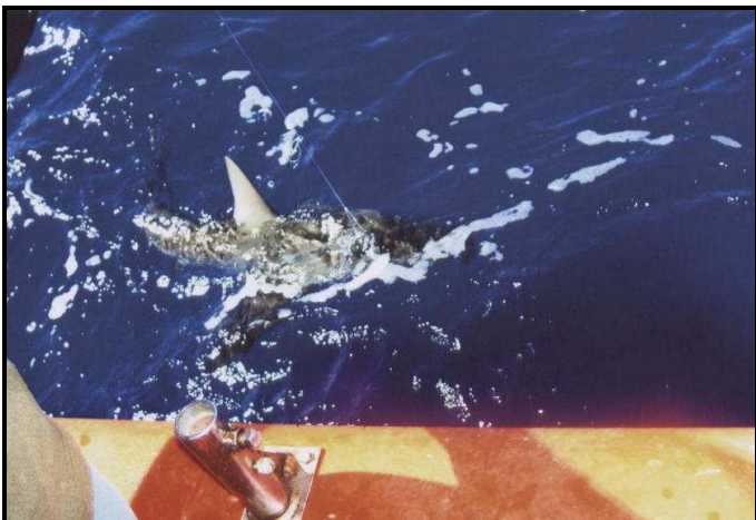
This port Jackson shark was dealt with using a shotgun. This Island seems to have a different set of rules