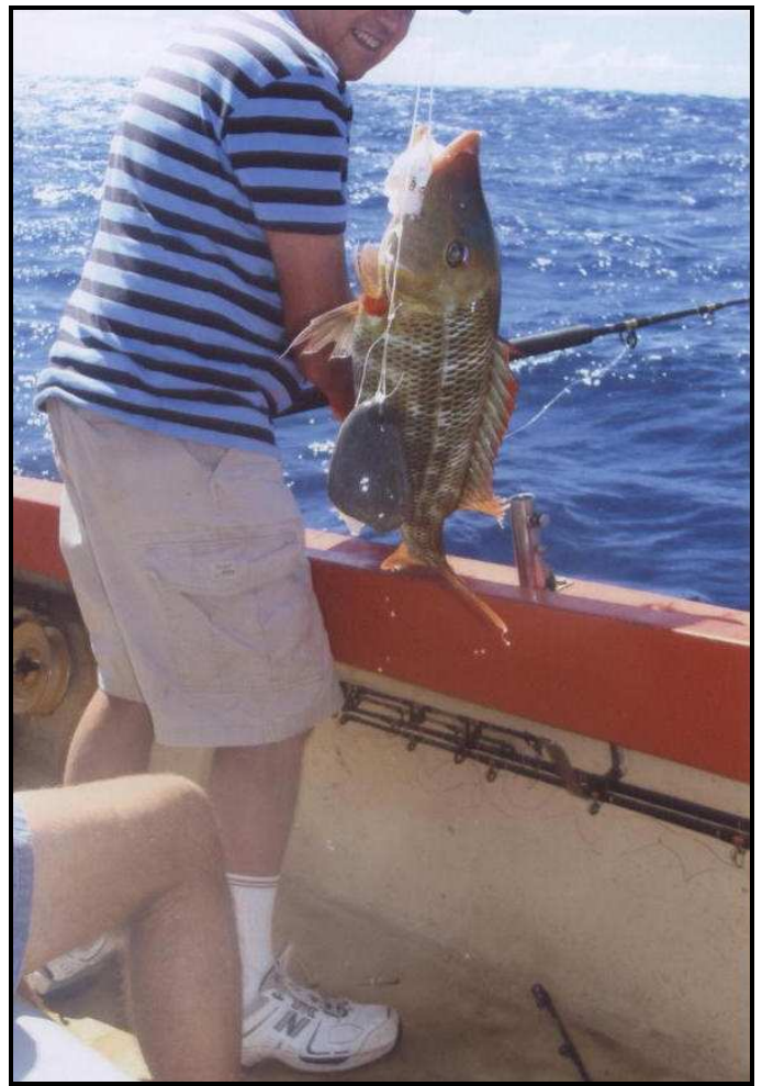
Some great sweetlip were caught and check out the sinker. A rock with a hole drilled in it.