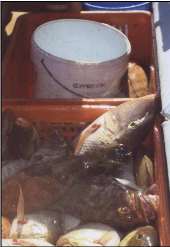
A good haul of fish, this was enough to feed 70 people at the nightly cook off.