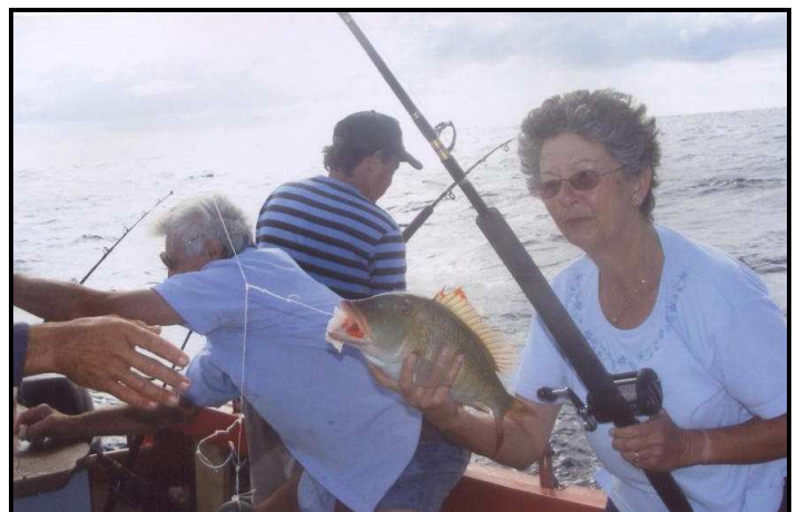
The charter operators had their hands full.