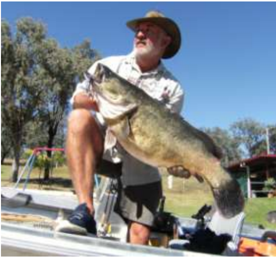
Had to put this one in, my 16kg Murray Cod from Glenlyon in March.