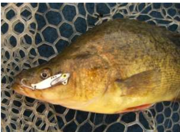
Jigging Blades and my new Shaker Baits worked