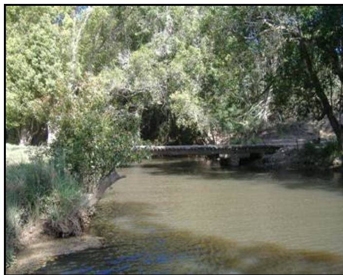
This low bridge stopped us from traveling further upstream in Dunbible Creek.

Dunbible Creek proved very interesting. The tide was half full and rising, so there was plenty of water in the creek. We were able to travel some kilometers upstream, with 3 to 6 feet of water under us most of the time, until we reached a low timber bridge that neither of us could get under.