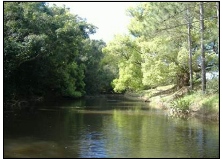
Another section of Dunbible Creek. Very scenic and very interesting.

So, if ever we do a club trip to Dunbible Creek – which the Trips Committee should seriously consider, because it is so nice and so interesting – we'll need to make sure we have a good big tide, with high tide around mid-day.