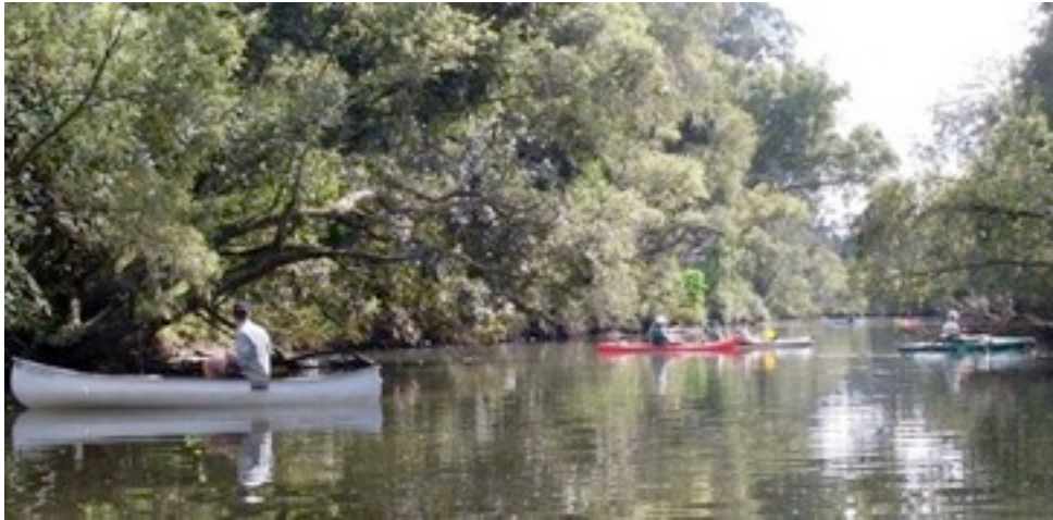
Albert River Bass tagging trip

The bass tagging trip in the upper logan was very busy from a boats in the water view. As you can see quite congested at times. In the picture above count 6 plus the photographer and one behind. About 14 bass where tagged by our club and there where visitors on the water as well. So quiet, as far as fish caught, but an interesting day Yours truly Mal Brown falling out of Trevor's canoe much to the delight of Trevor and even I could not stop laughing. Later in the morning I managed to pull a lure out of a tree at a huge velocity which returned to me and impaled itself in my cheek. The surgeon Trevor went to work and after taking the lure off the treble pinned me down on a sand bank (looked kind of suspicious from down the river) and removed it with very little pain !! See Pic