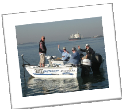
More fishing, less socialising