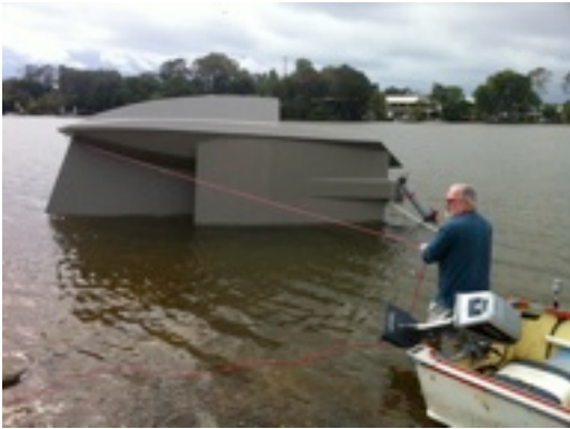
Interesting boat I spotted being launched for the first time, it was powered by electric motors