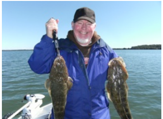
Couple of nice flatties from Browns Bay