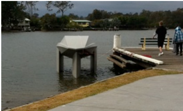
I think the boat was designed by the guy that imports the motors. I was god smacked when it was launched off the back of a tilt tray and hardly took a foot print on the water,