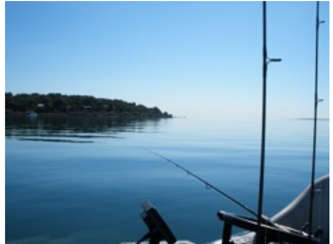
You get days like this sometimes!!